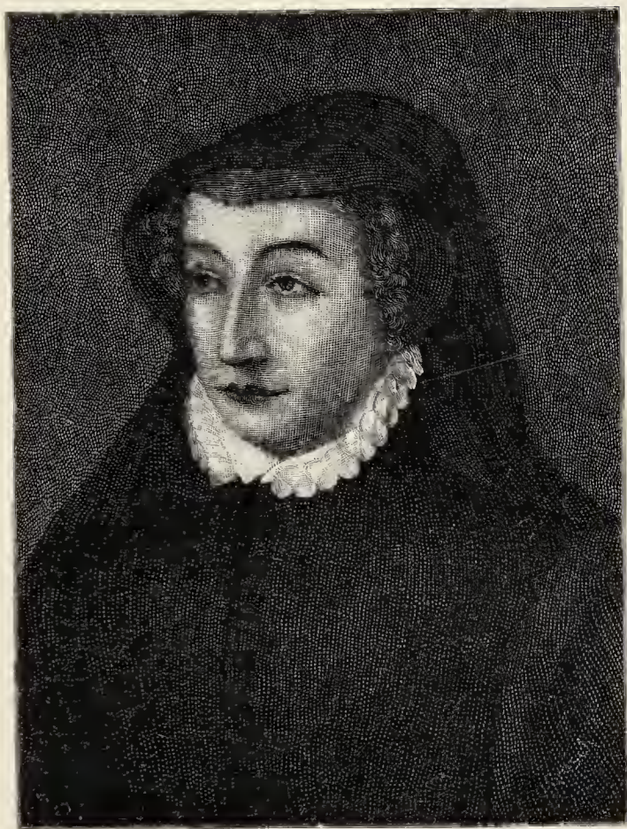
CATHERINE DE MEDICI Painting by François Clouet, Chantilly.